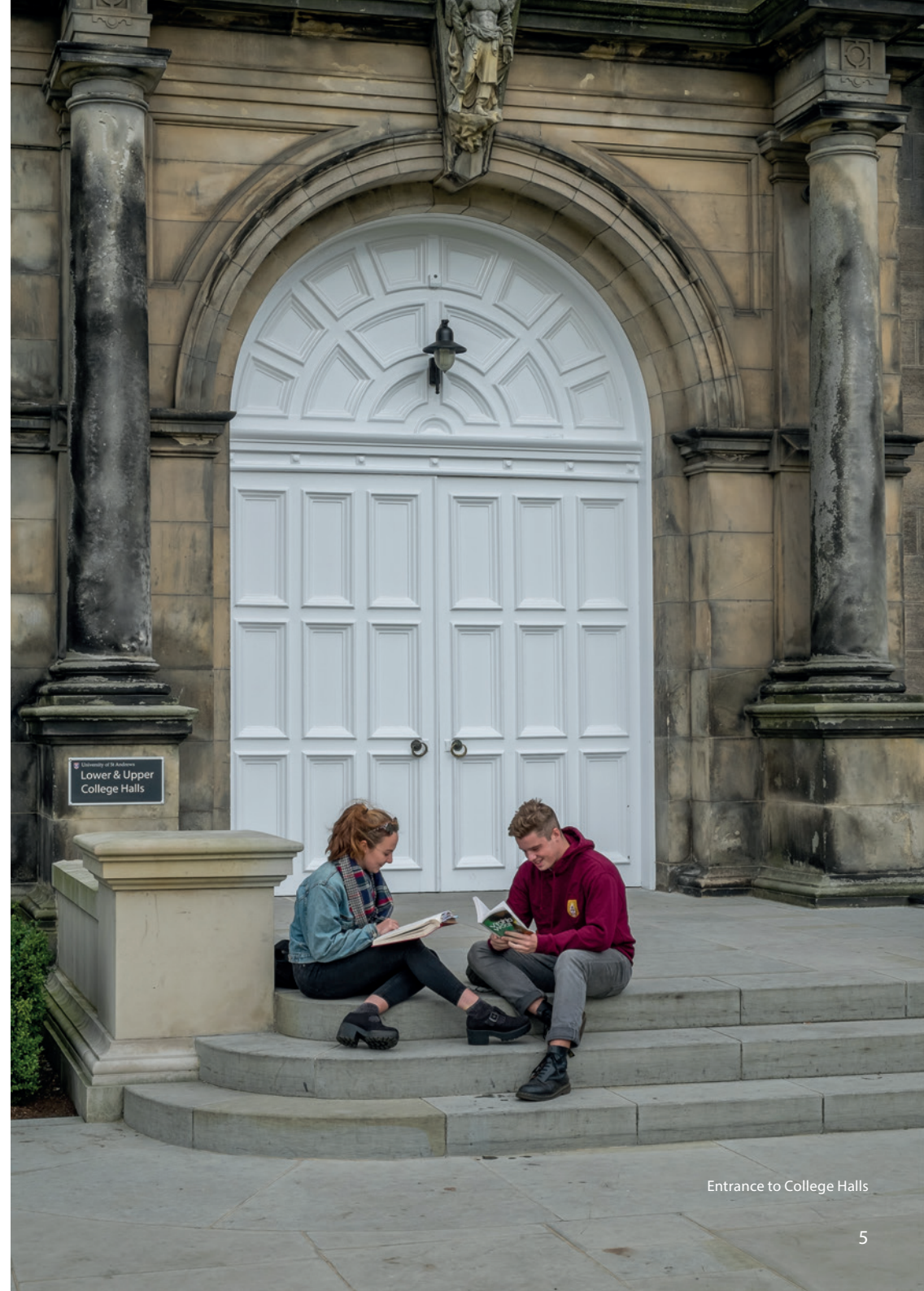
Entrance to College Halls

Students who meet the minimum English language entry requirement, and who would like to boost their English language skills , should consider attending a pre-sessional English language course: www.st-andrews.ac.uk/international-education/short-courses/pre-sessional