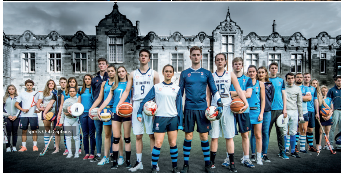
Sports Club Captains