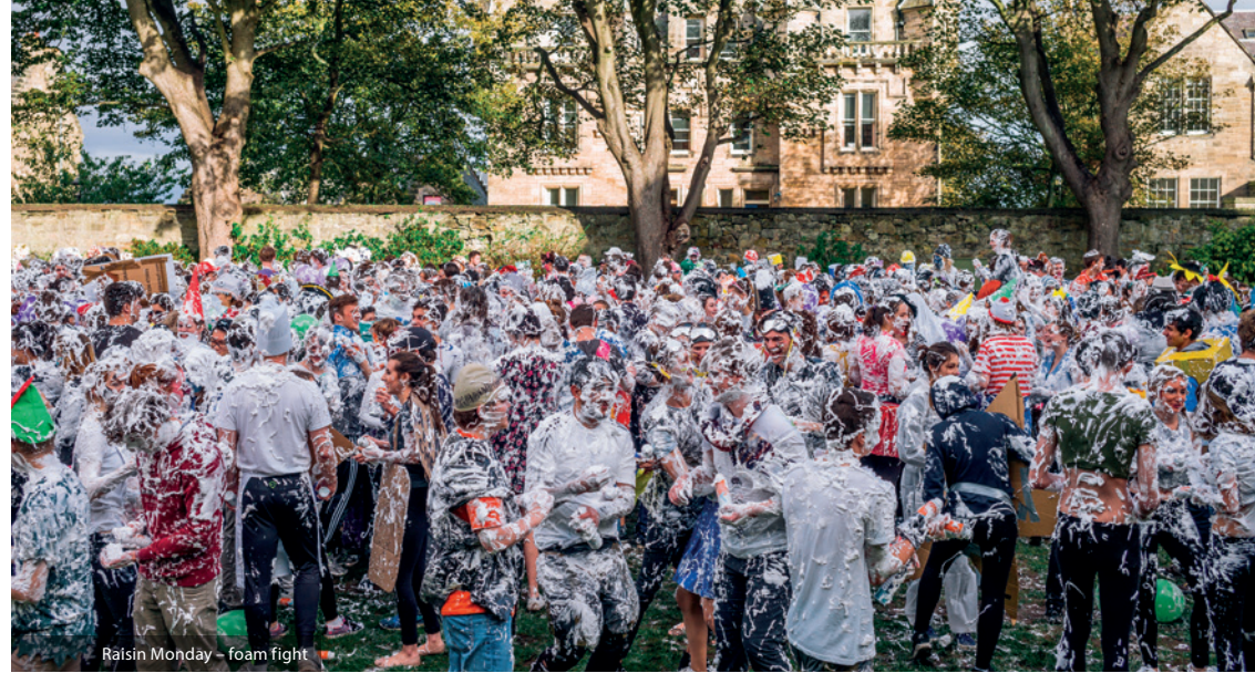
Raisin Monday – foam fight